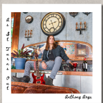
As It Turns Out